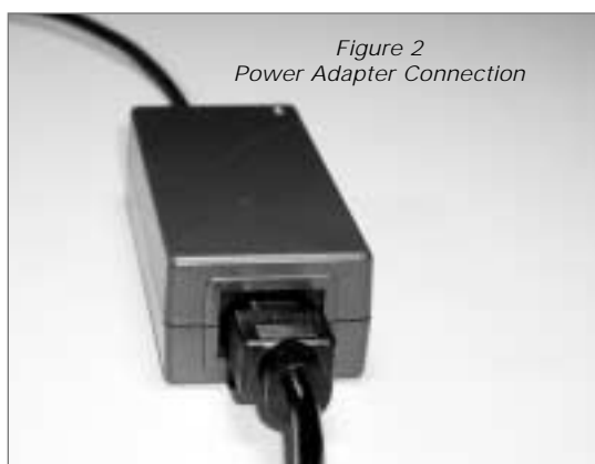
Figure 2 Power Adapter Connection