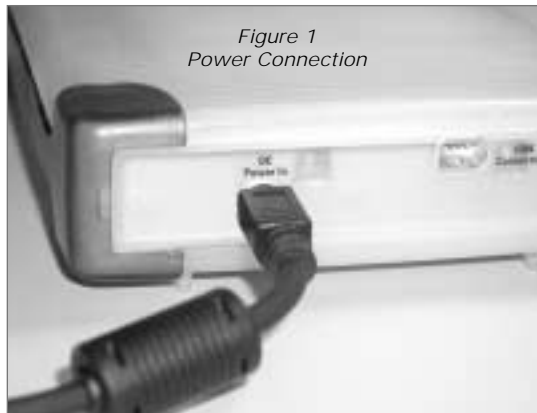
Figure 1 Power Connection