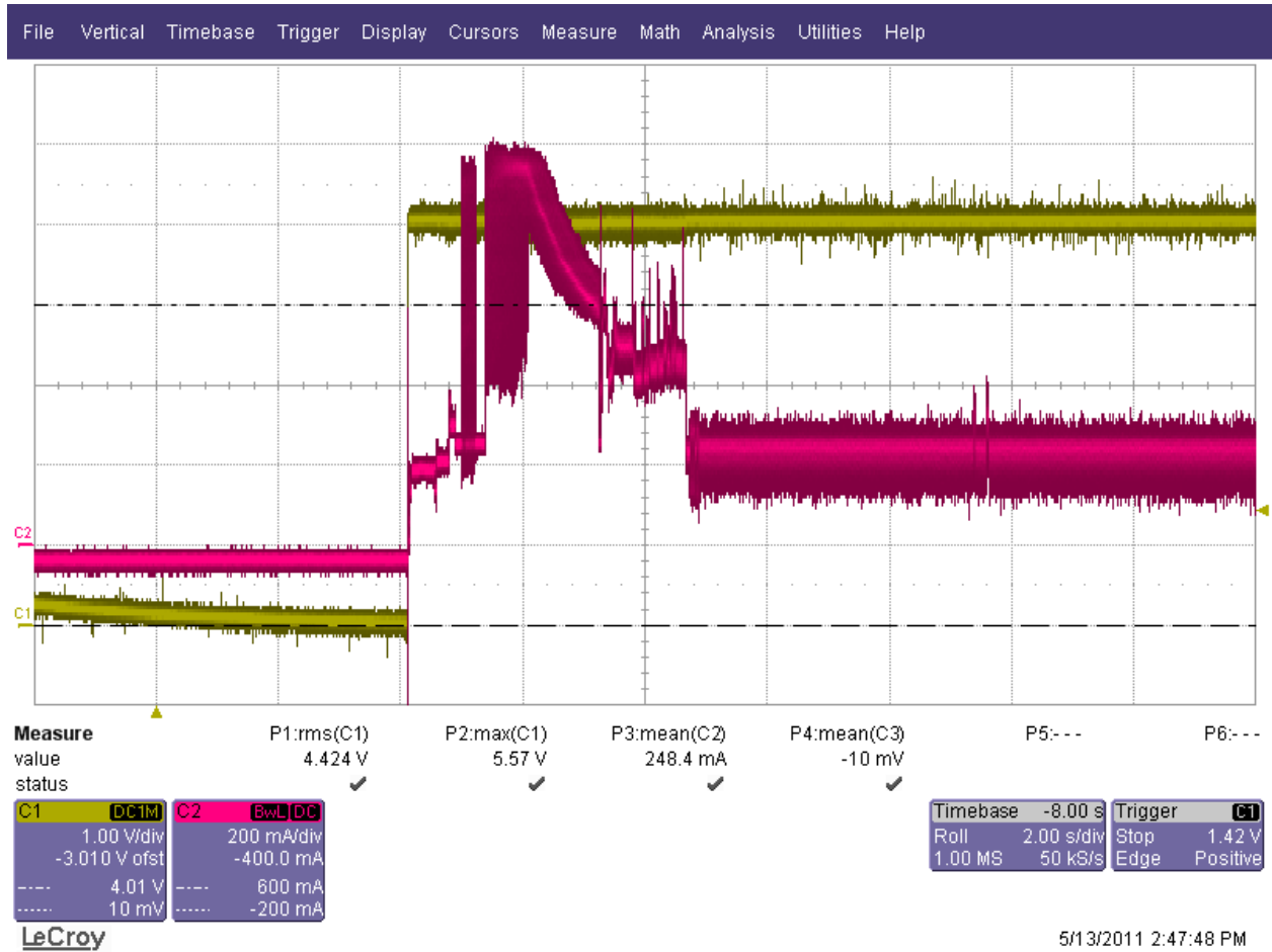
Figure 1. Typical +5V only startup and operation current profile