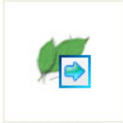
Auto Backup Update.exe

[Figure] Samsung Auto Backup Update Tool Icon