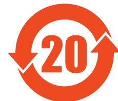
Table 5 Hazardous Substances

(Name and Content of the Hazardous Substances in Product)