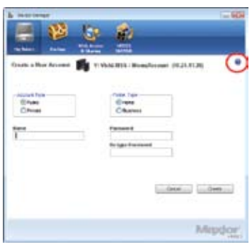
Click the ? Help button or view the Maxtor Central Axis User Guide for Windows found on the Central Axis storage server CD for detailed information on creating a user account.