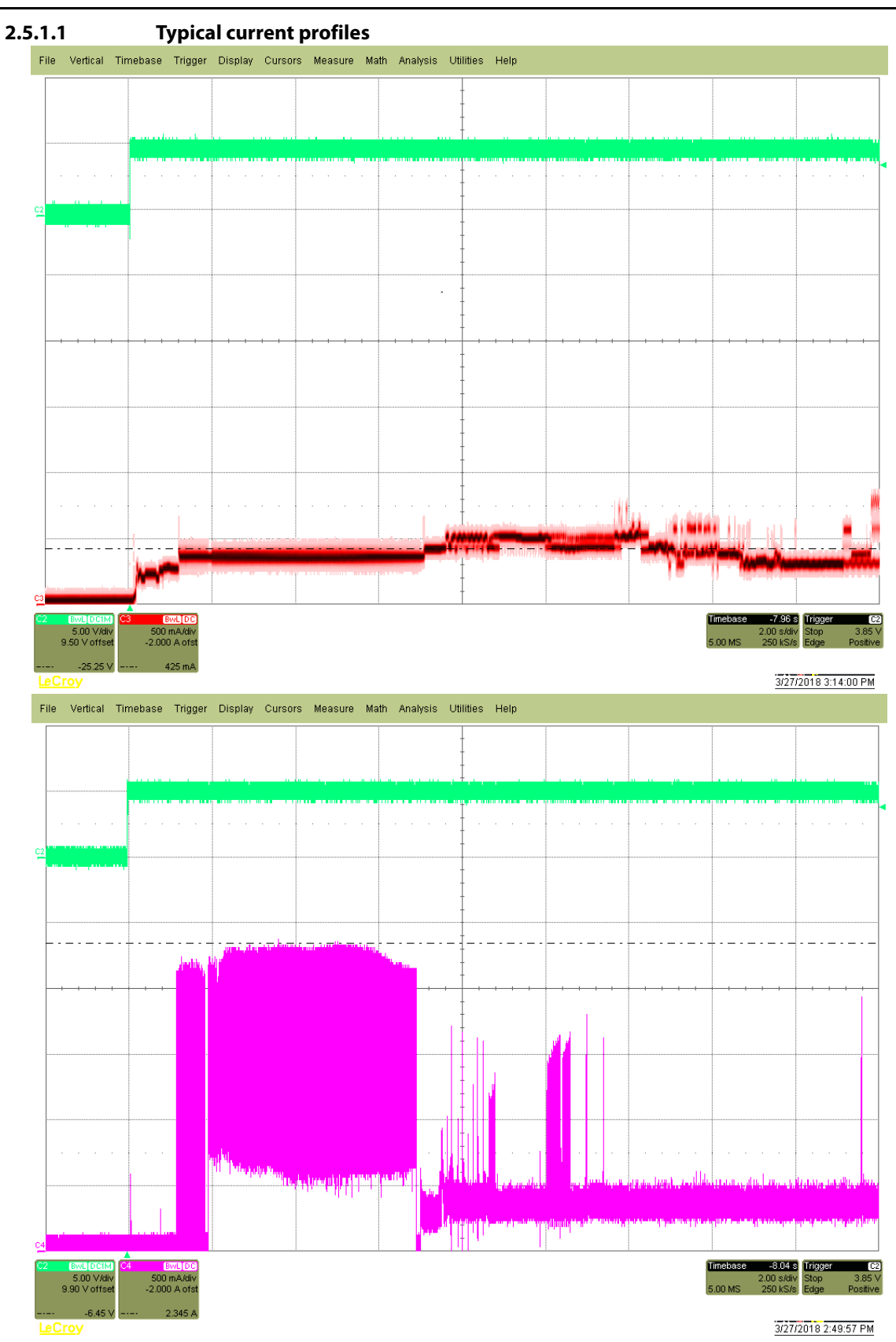
Figure 1. Typical 5V and 12V startup and operation current profiles