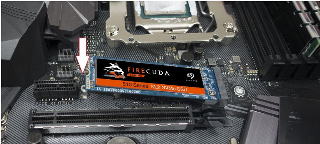
Figure 3: Seagate M.2 SSD in the M.2 Slot