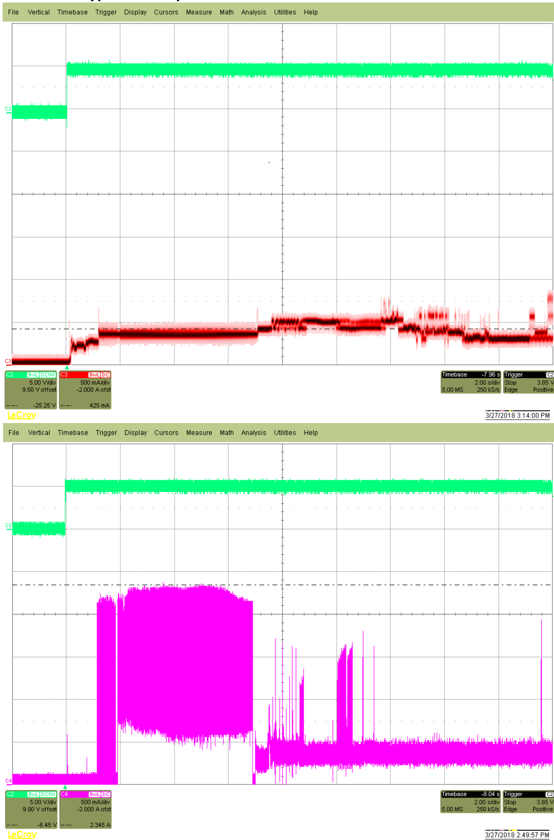
Figure 1. Typical 5V and 12V startup and operation current profiles