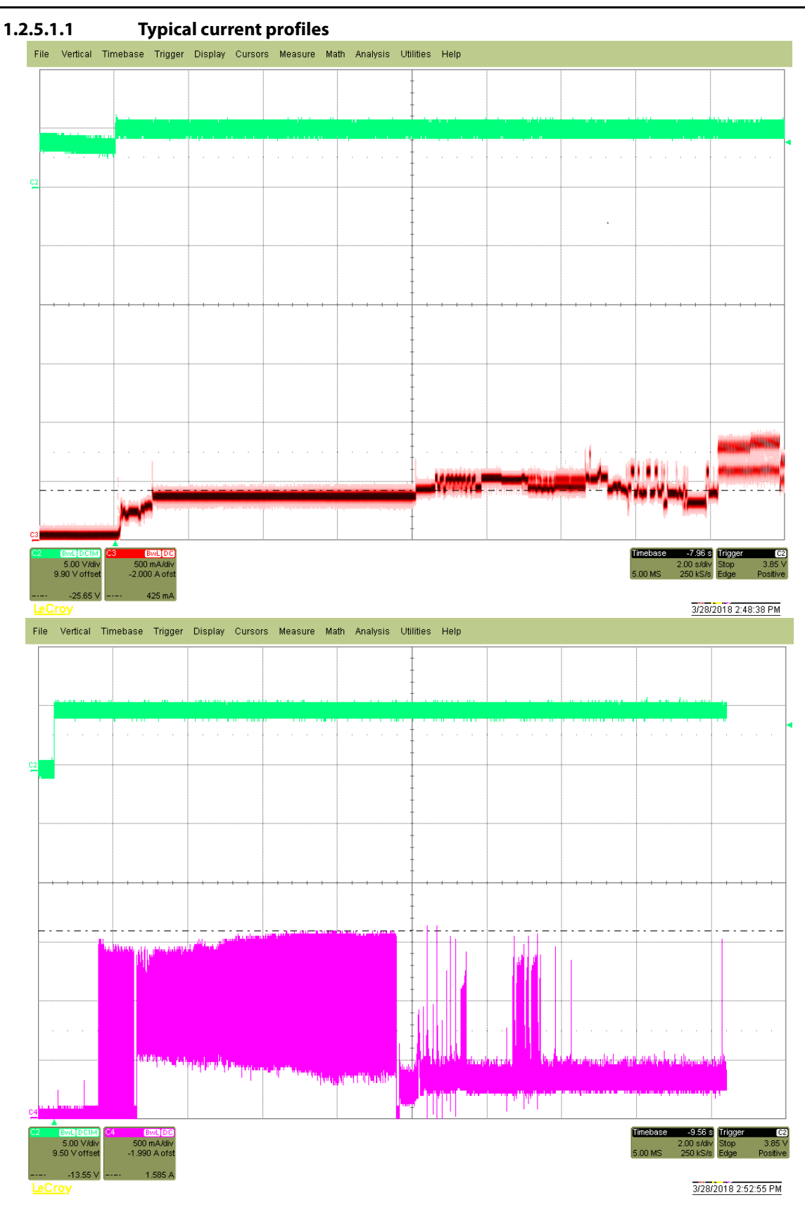
Figure 1. Typical 5V and 12V startup and operation current profiles