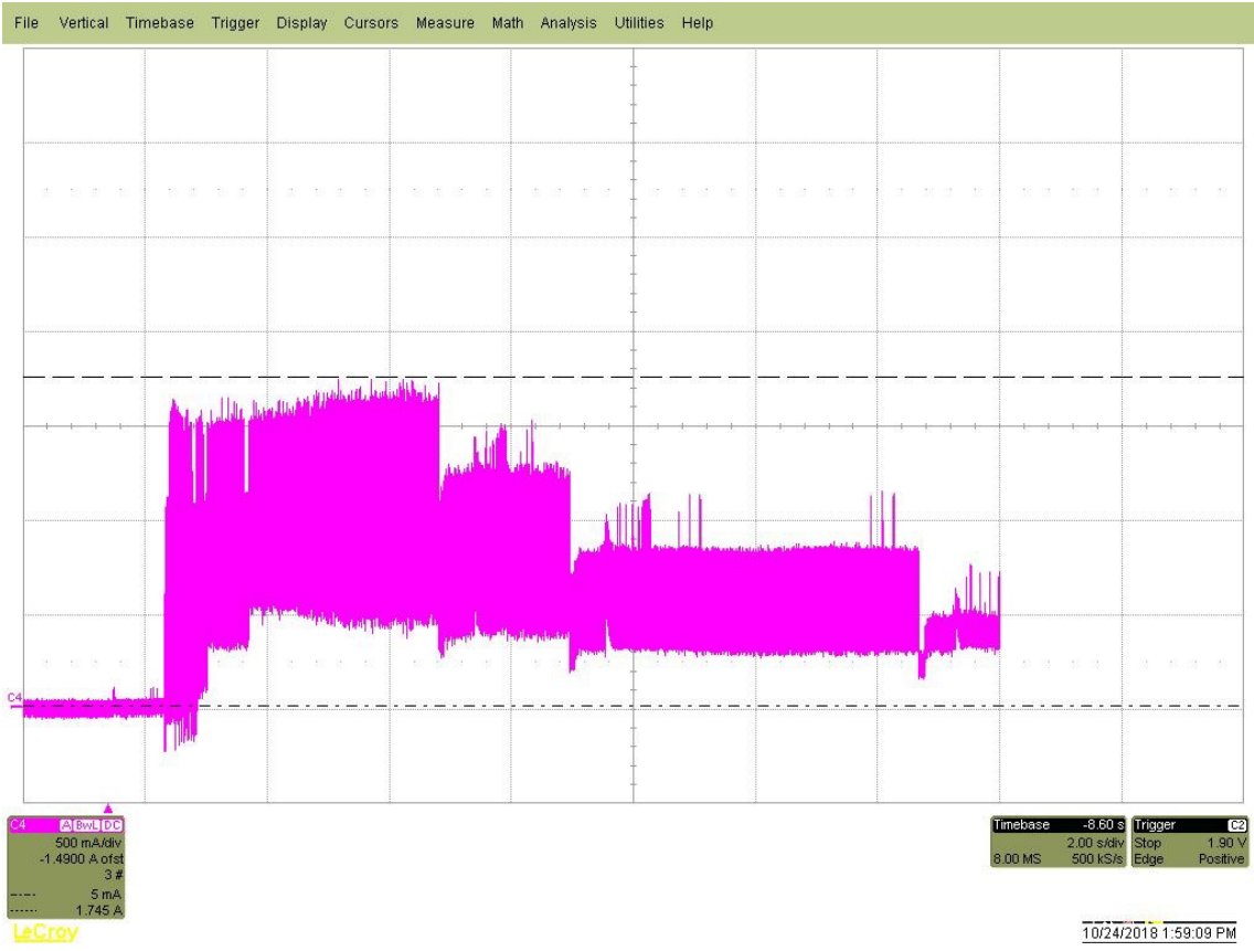
Figure 1. 8TB Typical 12V startup and operation current profile