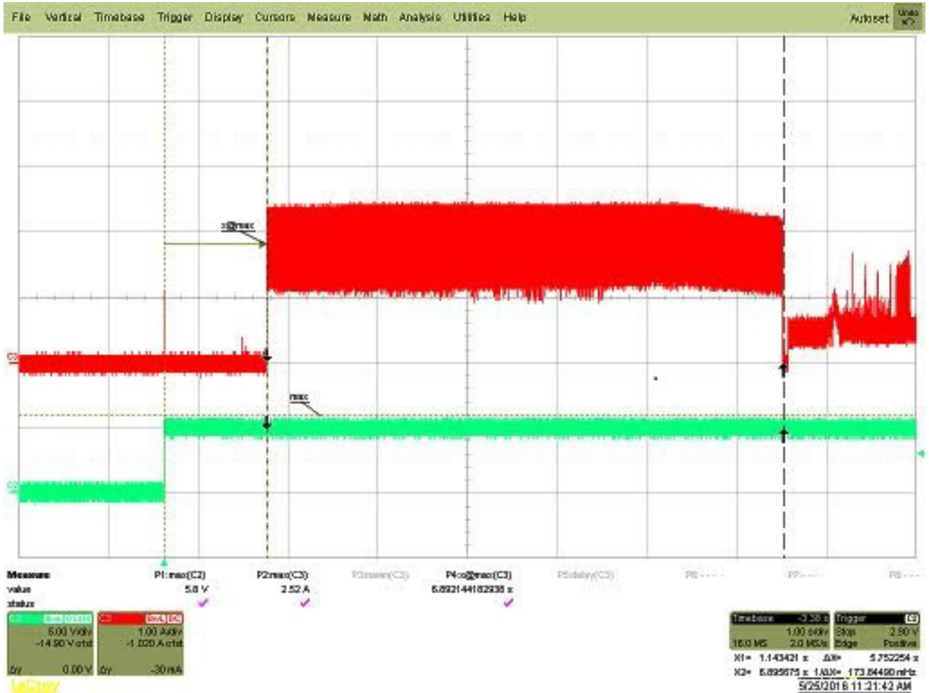
Figure 1 Typical Current Profiles (5V & 12V)