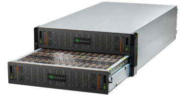
Figure 2: Seagate® Exos™ AP 5U84

The Seagate® Exos systems product line provides high capacity and industry leading efficiency in modular 2U, 4U and 5U form factors. The Exos AP 5U84 supports 84 3.5" SAS disk drives in a 5U rack-mount form factor storing up to 1.3PB of data while the optional dual redundant Intel Xeon server controllers with optional 100Gb/s Ethernet ports runs the DriveScale Composable software with zero additional rack footprint reducing data center costs and complexity.